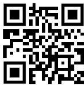
2 Session Survey