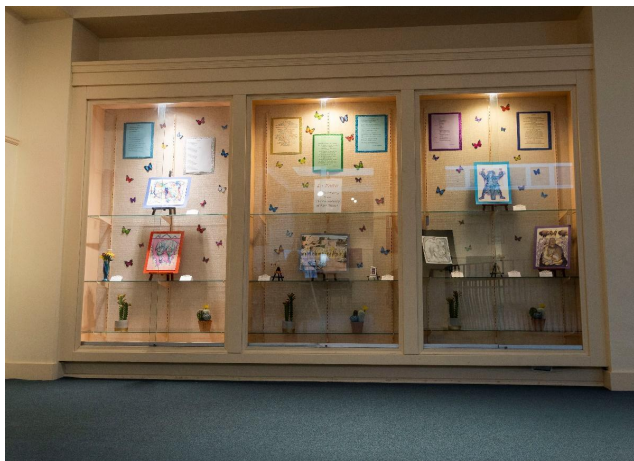
Level II Minimum Restrictive Unit Art Exhibit at the Satin I Reichman Main Library Gallery, 2019.

filmed practicing their storytelling and interviewed about what this program has meant for them and their family. In addition to their child receiving a book and recording of their father reading the children's book, their families were able to witness the fathers on the news and see just how much work they have put into staying connected with their loved ones and encouraging their children to read. FAR allows families to continue important bonding experiences and the more intensely parents are involved in their children's education the more those children are likely to thrive. The fathers' gifts of reading to their children made it just in time for the Christmas holiday.