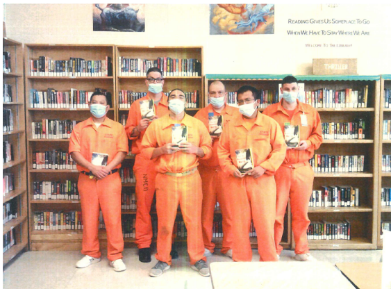
PNM book club participants for the NEA Big Read 2021.