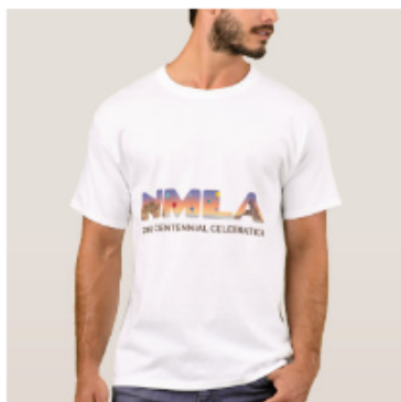
NMLA centennial logo tshirt $20.10 Comp. value ⓘ $16.08 Save 20%