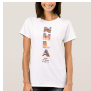
NMLA centennial logo tshirt $20.10 Comp. value ⓘ $16.08 Save 20%