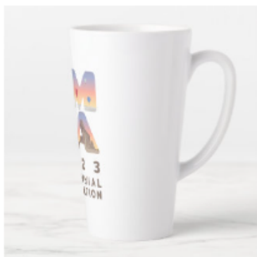
NMLA centennial logo mug $16.95 Comp. value ⓘ $13.56 Save 20%