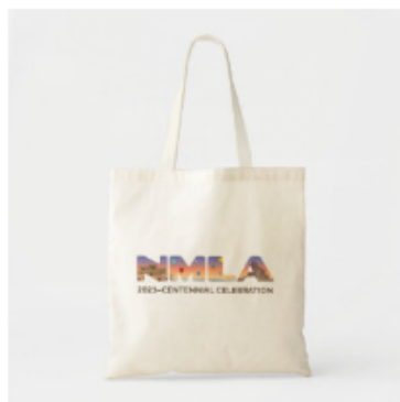
NMLA centennial logo tot... $17.20 Comp. value ⓘ $13.76 Save 20%