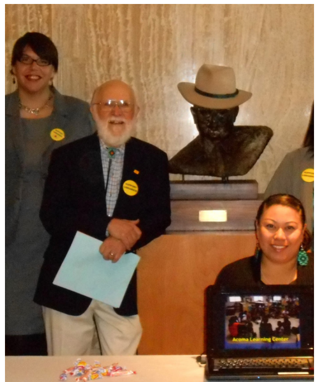
Legislative Day 2013